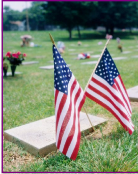
The ability to vote exists as one of the most cherished Constitutional Rights that many fought for, marched for, and died for over the centuries.