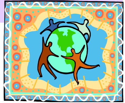
Loving God and neighbor in ways that bear fruit in the life of society.

The Church's social teaching is a rich treasure of wisdom about building a just society and living lives of holiness amidst the challenges of modern society. In "Love Thy Neighbor," we highlight themes that are at the heart of our Catholic social tradition.